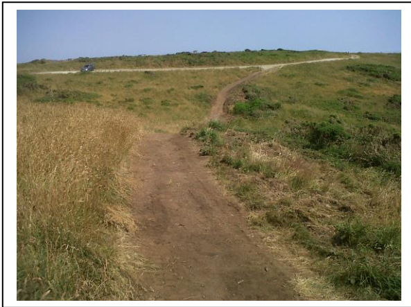
Coast path following the digger work

Throughout the Bolberry Down area the coast path is now up to a very high standard, it has a constant width of around 1.2m and is all fairly level, making it ideal for all ages and abilities to enjoy throughout the year.