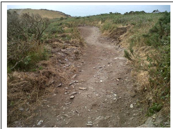
Cathole cliff alternative walking route