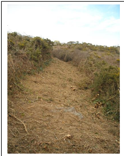
Cathole cliff cut ready for new easier walking route

to offer a wide easy accessible walking route on a good sustainable surface for the benefit of all walkers of all abilities on this popular section of the SWCP route.