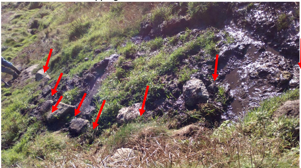
8x stepping stones & shallow ditches.

Granite stepping stones were used to provide a clear surface for walkers. Additional drainage ditches have been cut to enhance the drainage of the area. The benefits from this project include improved access to the beach at Nanjizel from the main access point at Land's End.